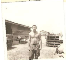
VIET NAM CHUMS.jpg (1696x2096)