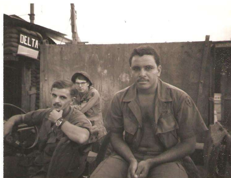
IN FRONT OF ORDERLY ROOM.jpg (800x608)